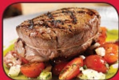
Beef Tenderloin Filet Mignon Steaks