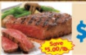
USDA Choice or Higher Boneless Beef New York Strip Steaks