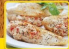
Gyro Stuffed Chicken Breast Greek Marinated Chicken with Pita, Gyro Meat, Onions, Tomato, Tzatziki Sauce, and Mozzarella Cheese