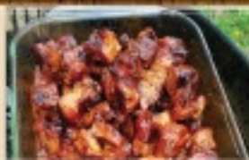
Chef's PRIME Pork Boneless Pork Rib Ends Nice Little Roasts or Cut for Grilling!