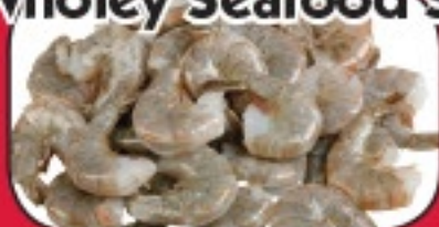
1 lb. pkg. 16/20 Peeled & Deveined Shrimp $8.99 each - $1.00 coupon