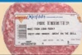
Lean Pork Tenderettes 3 per pound

These Prices Good Now Through Saturday, June 24th, 2017 at 3:00 p.m.