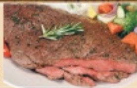
USDA Choice Cap Off, Boneless Beef Top Sirloin Steaks