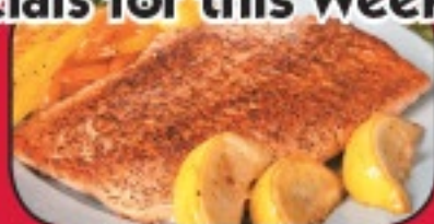
16 oz. Wild Caught Salmon Fillets $5.99 each - $1.00 coupon

1 coupon per person. 3 items per person. (Buy 1 of each item with coupon and get the other 2 for regular sale price.)