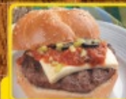
Pizza Burgers Made In-House with 2 Italian Sausage Patties Stuffed with Shredded Mozzarella Cheese