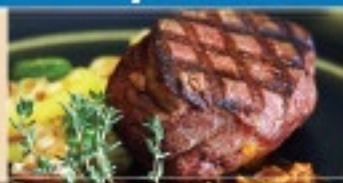
USDA Choice Beef Fillet of Sirloins