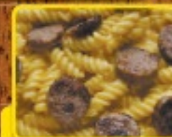
Brat-Tini Casserole Cooked Brat Meat, Rotini Pasta, Aged Cheddar cheese Sauce, & More Cheddar Cheese in a Take & Bake Pan