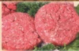
Lean Ground Chuck Patties All Sizes