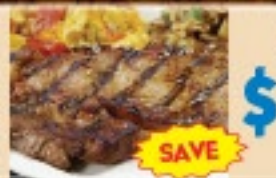
USDA PRIME Grade Boneless Beef Ribeye Steaks