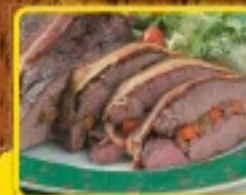
Mushroom & Herbed Cream Cheese Stuffed Sirloin PRIME Top Sirloin, Thick Cut, Stuffed with Fresh Sautéed Mushrooms, & a Well Seasoned Cream Cheese