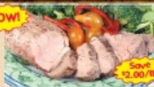
Whole, Frozen Pork Tenderloins 2 per pack