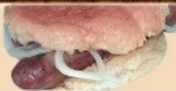
Grand Champion Bratwurst 4 per pound