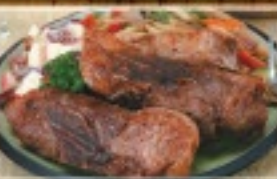
Bone-In Country Style Pork Ribs Great on the Grill