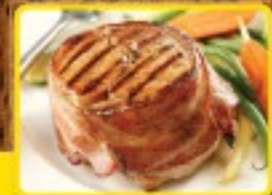
American Delights Pork Tenderloin with Thick Cut Onion and Tomato Wrapped in Bacon Excellent Topped with a Miesfeld's BBQ Sauce